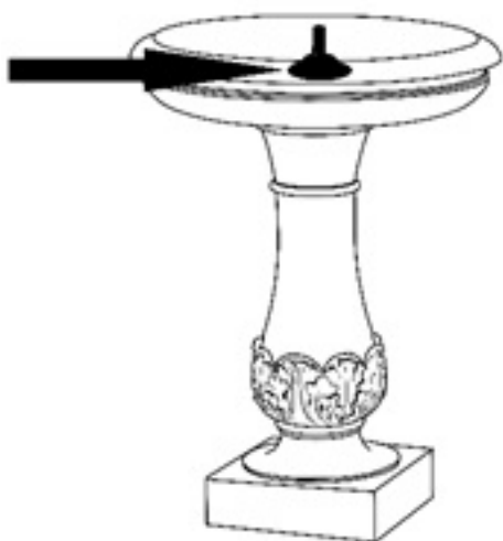
FT-141A (5 lbs) 5.5" W x 2.75" H